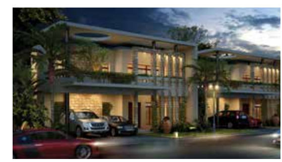
GINGER COUNTY PHASE - 2, KOLENCHERY