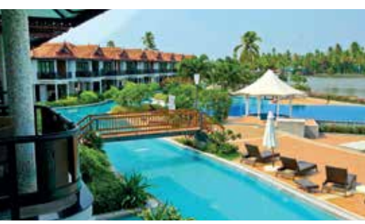
RAMADA RESORT, COCHIN