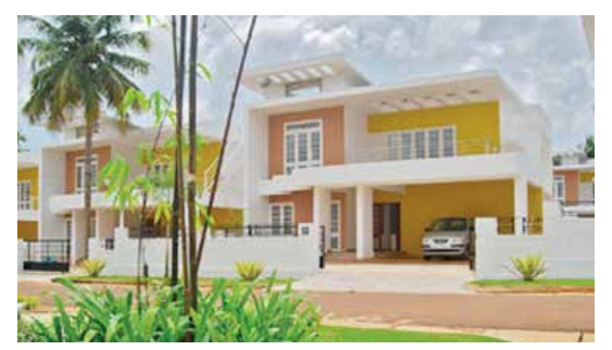
VANILLA GROVE, KOLENCHERY