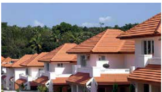
DICE VILLAS VOLENCHED